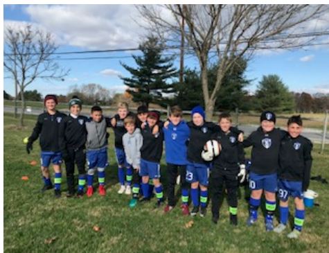
2007 CAPS Monaco

We kick off 2 nights per week of Winter training at NexLevel Arena the first full week of January. All training sessions should be listed in your TeamSnap account. Enjoy your rest and come recharged in the new year for a great Winter training and Spring season. In the meantime, we encourage you to watch soccer matches on tv and check out/try YouTube soccer drills/footskills on your own. Juggling is, as always, a great past time!