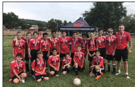
2006B Titans, 1 st in their flight

The 12 GFSC travel teams who played in the MNJYSA league finished the fall season with a record of 46-55-15 with 229 goals scored and 284 goals against . There were only 4 un-played games across all our teams. Half of our teams finished with at least a 0.500 season which was great to see. Congratulations to the 2006B Titans who finished 1st in their flight and to the 2005B Rangers and the 2008G Jaguars who finished 2nd in their flight! The 2010G Spirit and 2011B Revolution finished strong in their flights despite standings not being reported for their birth year. A few of our teams were in very challenging flights which resulted in a rough season. The league will do its best to adjust to a more appropriate flighting for spring. All teams will continue to develop as the year progresses.