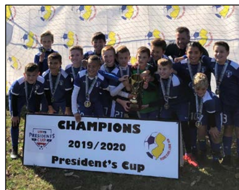
CAPS 09 PSG 2019 President's Cup Winners

Our CAPS teams attended the EDP Fall Classic and the EDP Winter Classic and we had winners in both! 2005B Arsenal and 2004G AC Milan won the Fall Classic with the 2008B Atletico coming in second. The 2004B Liverpool won the Winter Classic. Great representation from our teams!